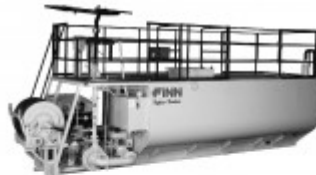
T280/330 HydroSeeder® Parts and Operator's Manual

8281 LeSaint Drive • Fairfield, Ohio 45014 Phone (513) 874-2819 • Fax (513) 874-2914 Parts Dept.: 1-800-228-8797 Sales: 1-800-543-7199