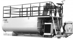
EURO-SEEDER T400 CE "TITAN"

PRODUCT DESCRIPTION FINN - the inventor of the Hydroseeder - is the world leader for over 80 years now in manufacturing these specialized machines that provide those Business Professionals anxious to intervene in the hydroseeding and hydromulching sector with power, efficiency and professionalism with the right equipment.