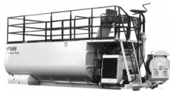
EURO-SEEDER T280 CE "TITAN"