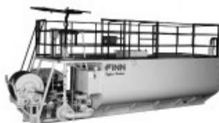
T280/330 HydroSeeder® Parts and Operator's Manual

8281 LeSaint Drive • Fairfield, Ohio 45014 Phone (513) 874-2819 • Fax (513) 874-2914 Parts Dept.: 1-800-228-8797 Sales: 1-800-543-7199