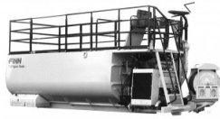
EURO-SEEDER T400 CE

PRODUCT DESCRIPTION FINN - the inventor of the Hydroseeder - is the world leader for over 80 years now in manufacturing these specialized machines that provide those Business Professionals anxious to intervene in the hydroseeding and hydromulching sector with power, efficiency and professionalism with the right equipment.