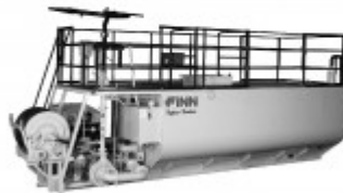
T280/330 HydroSeeder® Parts and Operator's Manual

9281 LeSaut Drive • Fairfield, Ohio 46014 Phone (513) 674-2819 • Fax (513) 974-2914 Parts Dept.: 1-800-228-8707 Sales: 1-800-543-7956