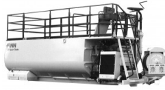
EURO-SEEDER T330 CE

PRODUCT DESCRIPTION FINN - the inventor of the Hydroseeder - is the world leader for over 80 years now in manufacturing these specialized machines that provide those Business Professionals anxious to intervene in the hydroseeding and hydromulching sector with power, efficiency and professionalism with the right equipment.