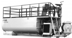
EURO-SEEDER T280 CE