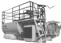
EURO-SEEDER T170 CE

PRODUCT DESCRIPTION FINN - the inventor of the Hydroseeder - is the world leader for over 80 years now in manufacturing these specialized machines that provide those Businesses anxious to intervene in the hydroseeding and hydromulching sector with power, efficiency and professionalism with the right equipment.